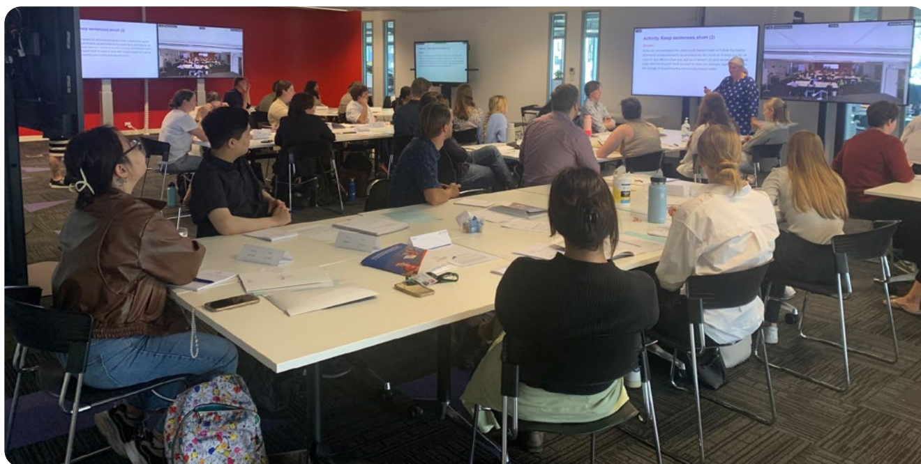
Plain English workshop at Centre for Legal Studies.