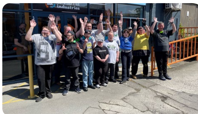
26Ten learners and their co-workers at St Vincent Industries.

Glenorchy City Council partnered with Metro Tasmania, both members of the 26Ten Network, to host a pop-up event for 150 Metro staff at Metro's Moonah depot.