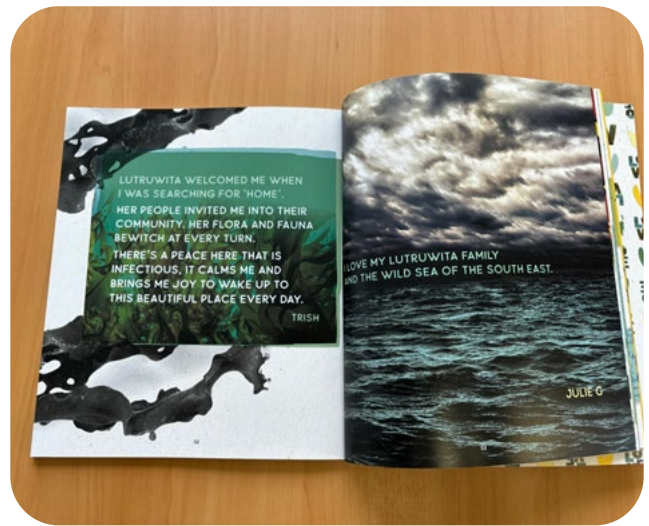
Lutruwita Love Stories, Huon Valley edition.