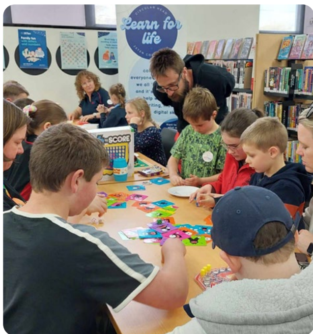
The 'Food and Fun - Family Boardgame Afternoon' at Smithton Library, with Circular Head 26Ten Community.

Libraries Tasmania and 26Ten Communities around Tasmania hosted games events encouraging families to play and have fun together.