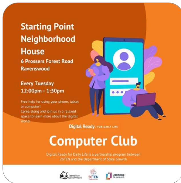
Northern Suburbs Computer Club flier.