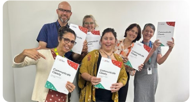
Participants at the Hydro Tasmania plain English workshop.

Demand for plain English workshops has increased by 30% over the past 12 months with 58 workshops delivered across the State in 2024.