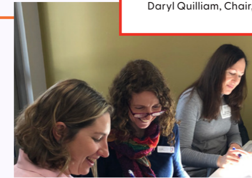
Literacy practitioners learn the Big Six of Reading